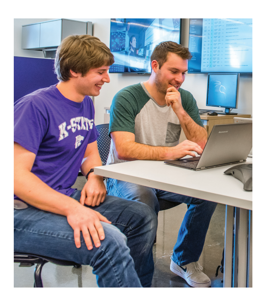
ABOVE: STUDENTS WORK TOGETHER ON AI AND DATA SCIENCE LAB PROJECT. ON THE COVER: WILLIE THE WILDCAT VISITS WITH STUDENTS IN CS LAB.